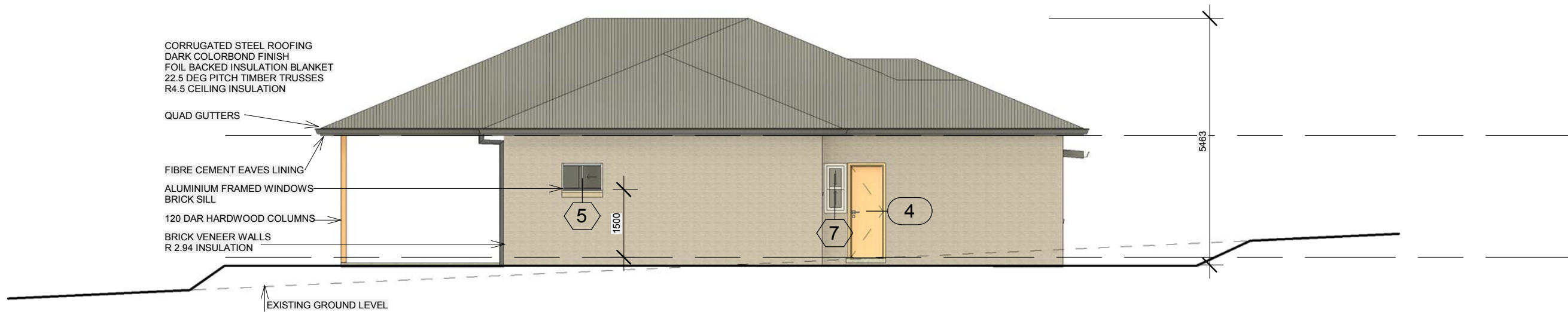
2 West 1 : 100