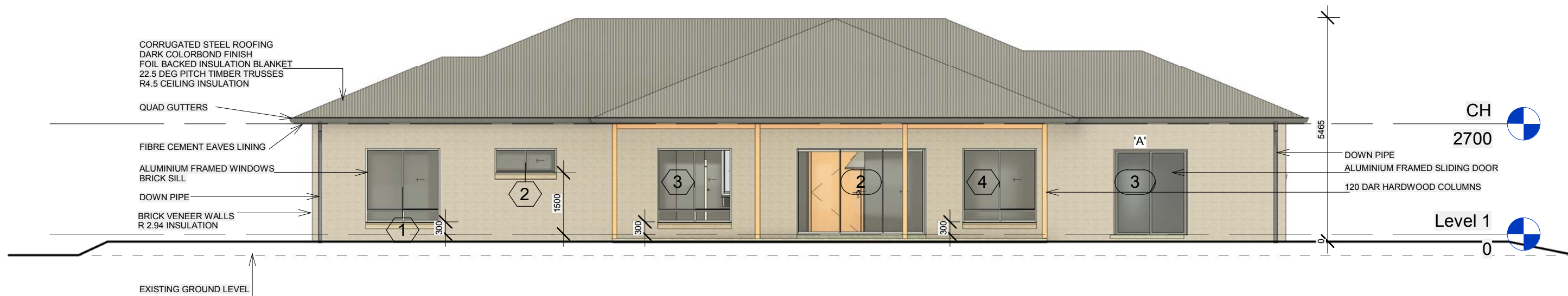
2 North 1 : 100