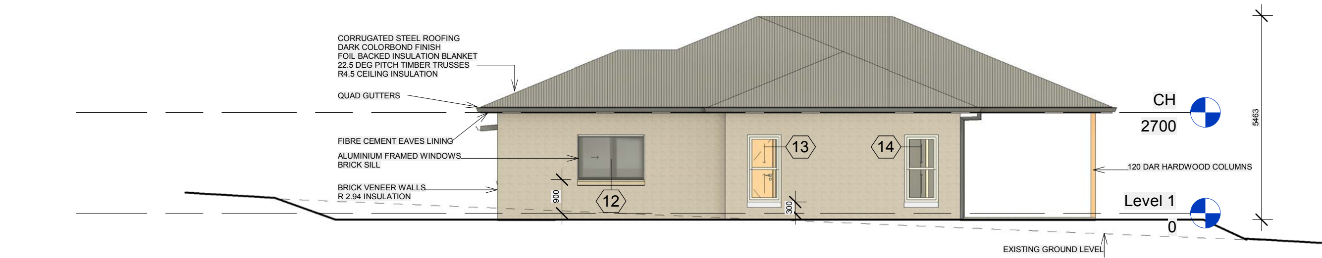
1 East 1 : 100